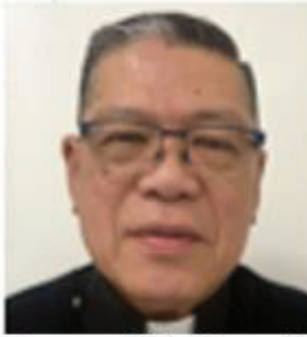
Pastor - Holy Cross & Canadian Martyrs

"Forever in our hearts; always remembered with love."