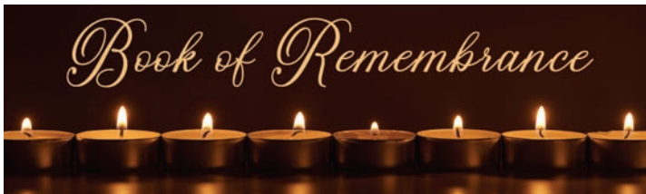
Book of Remembrance