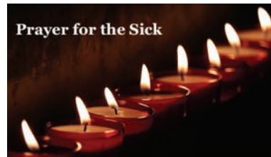
Prayer for the Sick